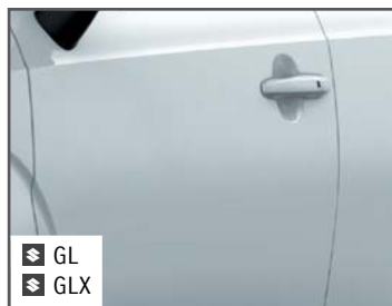
Arctic White Pearl