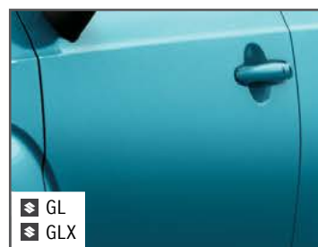
Turquoise Blue Pearl Metallic