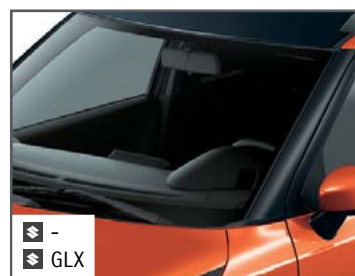
Lucent Orange & Midnight Black