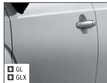
Silky Silver Metallic