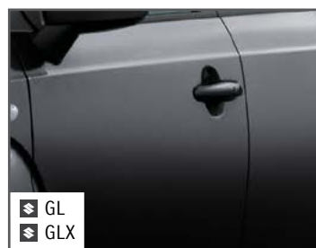
Midnight Black Pearl Limited